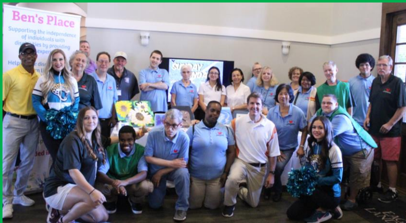
2022 Golf Tournament