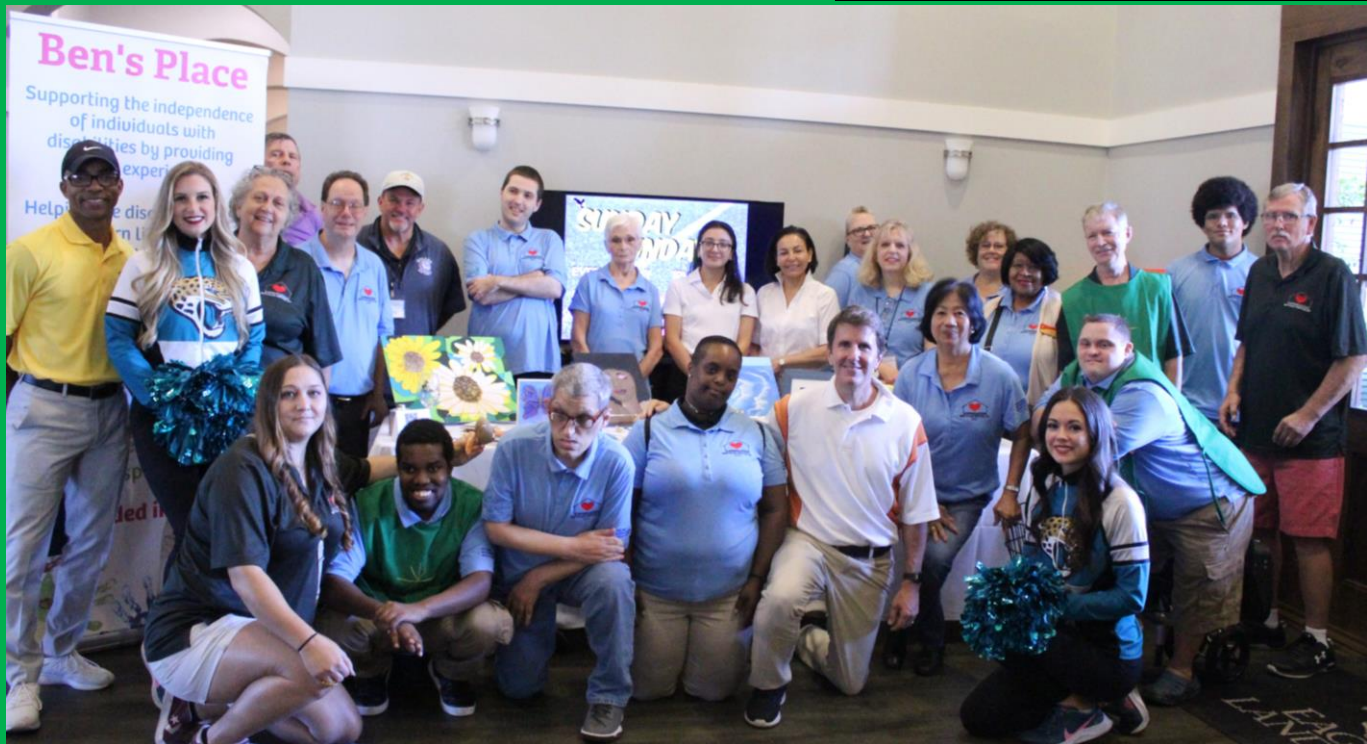
2022 Annual Golf Tournament @ Eagle Landing

Thanks to our Friends of Ben's with your continued donations. We appreciate your kindness and support.