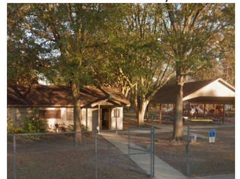
Our NEW Home 1751 Lindsey Rd.