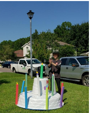
Visit us online at www.bensplacecof.org