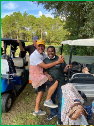
Fun at the Golf Tournament