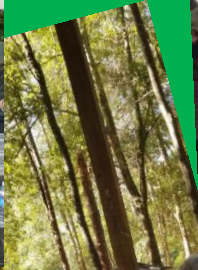
Fun at Tillie Fowler Park!